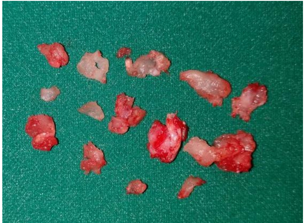
FIGURE 2: Excised surgical specimen in pieces.

auditory canal, mastoid cavity, and middle ear in a piecemeal fashion (Figure 2) and was sent for histopathological examination. Necrotic incus remnant was removed and ossiculoplasty was undertaken. Gel foam was placed in situ, post-auricular closure suturing was done in three layers, and mastoid dressing was applied. The dressing was removed on the third postoperative day, and the external suture was removed on the tenth postoperative day, displaying a healthy wound. No recurrence or complication was noted until the seven-month postoperative follow-up.