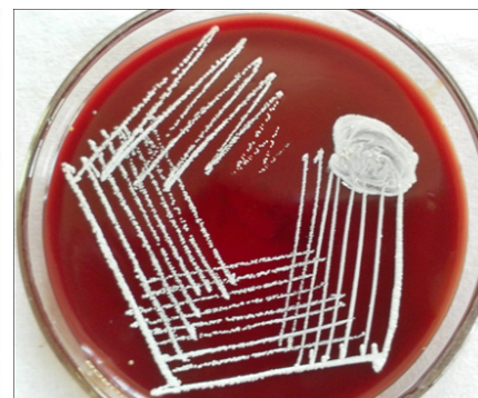
[Table/Fig-1]: Photomicrograph of pleural fluid showing gram positive filamentous branching rods. (Gram's stain, ×1000). [Table/Fig-2]: Photomicrograph of pleural fluid showing acid fast branching filamentous bacilli. (Modified Ziehl Neelsen stain, ×1000). [Table/Fig-3]: Blood agar plate showing chalky white dry colonies of Nocardia brasiliensis .