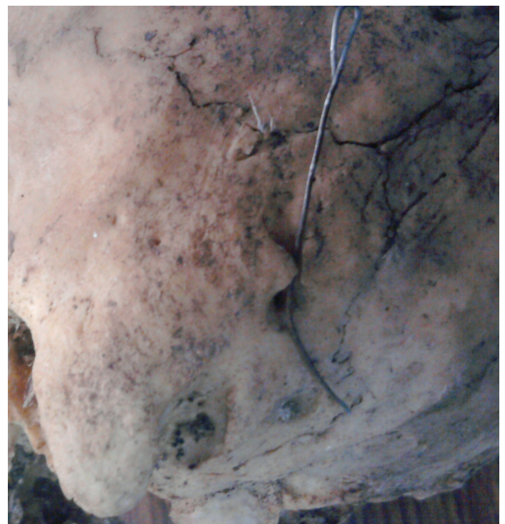
[Table/Fig-1]: Shortest Mastoid Canal

Mastoid canals of varying lengths were present in 53(53%) of the total 100 skulls which were observed, either bilaterally