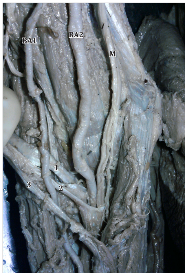
Figure 3. Insertion of biceps brachii and the relations to neurovascular structures. ( BA1 : brachial artery-1; BA2 : brachial artery-2; M : median nerve; 1, 2, 3 : tendons of biceps brachii)

In Gray's Anatomy the incidence of 3rd head of biceps brachii is reported up to 10% [1]. Kasugi et al. described the incidence up to 9–22% [4]. Rai et al. described the incidence of 3rd head of biceps brachii in Indian population up to 7.1%, and also described about the insertion of 3rd head into the radial tuberosity along with the other two heads of the muscle [8]. In our case the 3rd head of biceps brachii took its origin from the coracoid process of scapula along with short head and coracobrachialis. It had a thick and short muscle belly, then joined remaining two heads for insertion. While inserting