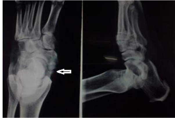
X- ray 3: Case 2