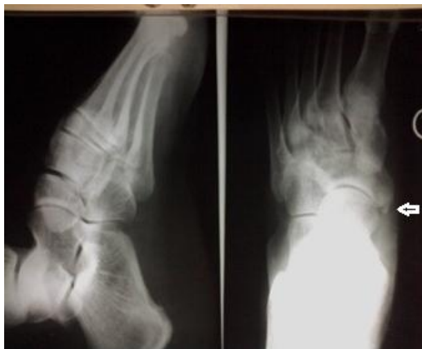
X- ray 2: Case 1