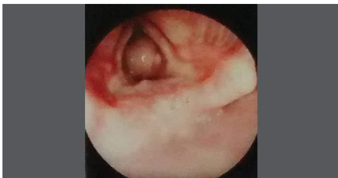
[Table/Fig-1]: Fiberoptic laryngoscopy

Benign laryngeal lesions, especially vocal fold polyps are very common [1] and usually present with hoarseness, vocal fatigue, cough, or foreign body sensation and dysphonia [2]. Laryngeal pathologies may be confused with the symptoms of asthma [3]. The initial dyspnea and wheeze of small sized laryngeal polyps leads to this misdiagnosis. If airway is compromised by mechanical obstruction particularly at subglottis, it manifests with stridor. Subglottic polyps are less common and present with airway obstruction which may become life threatening. Pharyngeal and laryngeal pathology caused