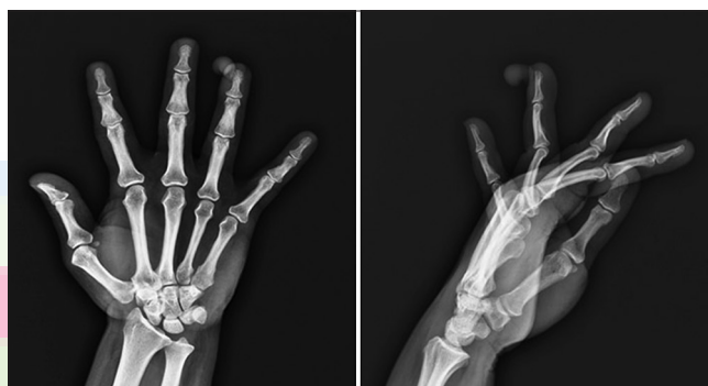
Figure 2: A plain X-ray (anterolateral and lateral views) of the left hand showed a well-defined soft tissue shadow around the tip of the ring finger without any connection with the distal phalanx