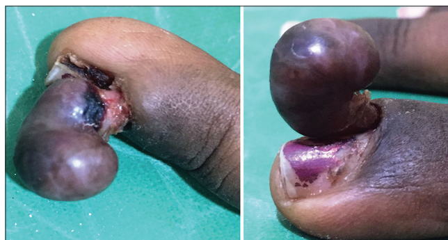
Figure 1: A 3 cm × 2 cm skin-coloured pedunculated growth arising from underneath the proximal nail fold of the left ring finger