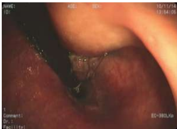
Fig. 1: Proliferative growth at 4 o'clock position involving the one third circumference of anorectal region