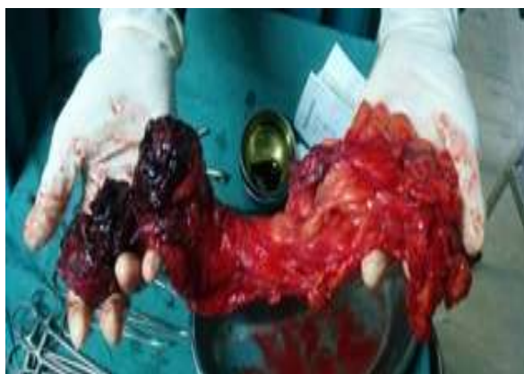
Fig. 3: Abdomino perineal resection