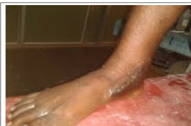
Figure 6: clinical picture after cast removal.