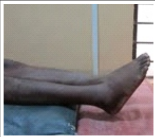
Figure 9: post operative ankle plantar flexion.