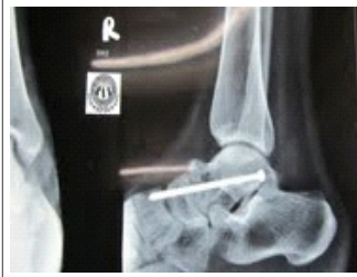
Figure 2: post operative radiograph.