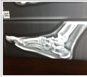
Figure 10: 6 months follow up radiograph.

are considered as variant of the same pathologic process and hence for radiological diagnosis diameter more than 2cm is considered as osteoblastoma [8]. Nicholas and Jack concluded that, it seems virtually impossible to diagnose benign osteoblastoma without benefit of histopathological studies of the material [4].