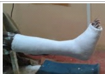
Figure 5: post operative cast immobilisation.

Radiologically lesion was lytic with 2x3 cm in size with sclerotic rim. The differential diagnoses include aneurysmal bone cyst and osteoid osteoma [1]. Osteoid-osteoma and osteoblastoma