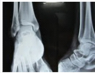
Figure 1: pre operative radiograph.