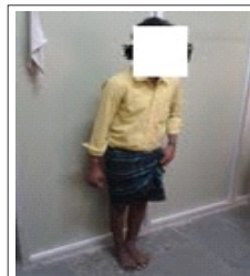
Figure 7: Clinical picture standing.