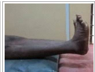
Figure 8: Post operative ankle dorsiflexion.