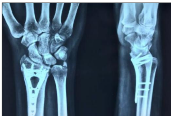
Fig 3: Pre-Operative