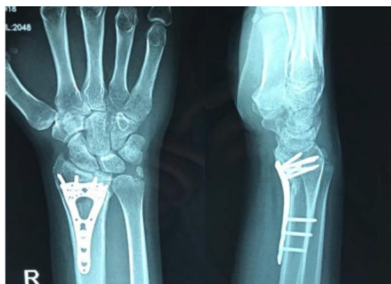
Fig 4: Immediate Post OP