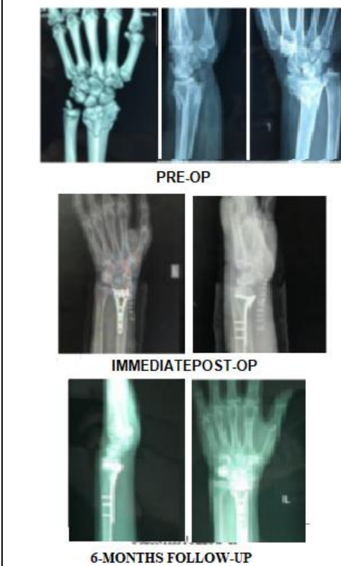
Fig 6: Radiographs of Case 2.