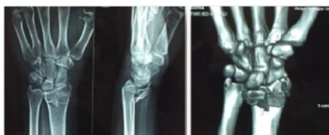
Fig 2: Radiographs of Case 1