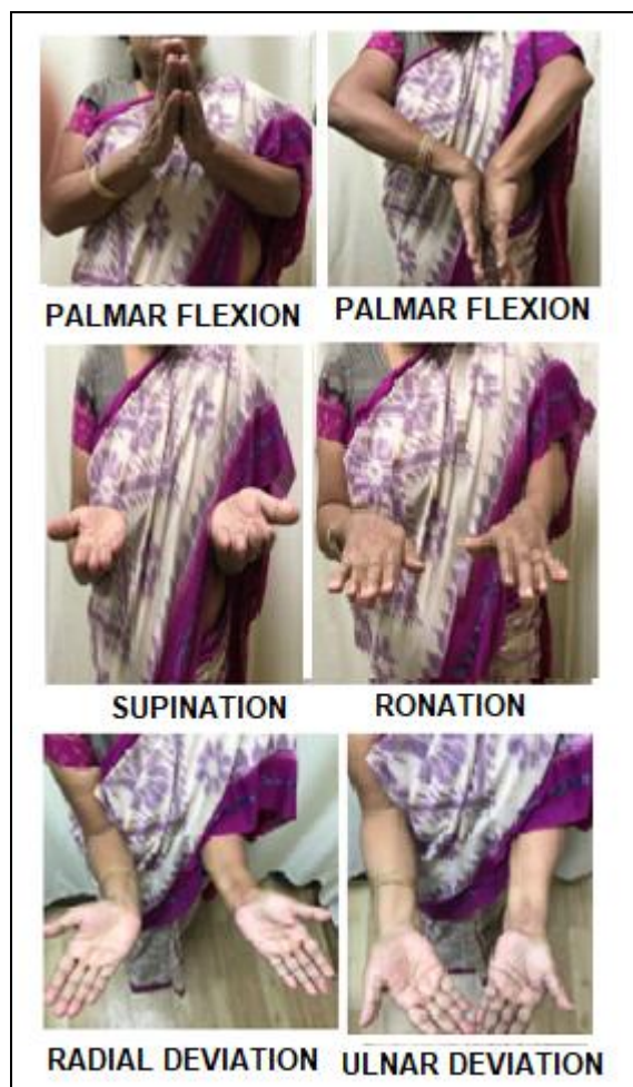
Fig 7: Fig 7- post operative clinical pictures of case 2.