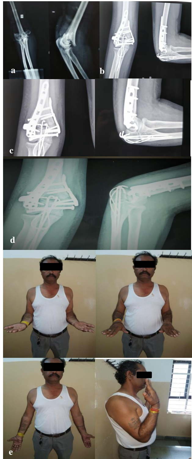
Figure 3: (a) Preoperative, (b) 6 weeks, (c) 3 months, (d) 6 months and (e) Range of motion 6 months postoperatively.