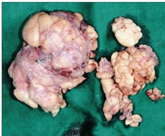
Figure 1: Image of sialolipoma showing multiple, irregular, nodular, tan-yellow, capsulated tissue bits

Various morphologic differential diagnoses for sialolipoma are true lipoma, lipoadenoma, lipomatosis and lipomatous pleomorphic adenoma. True lipoma is characterized by mature adipocytes arranged in a lobular pattern which replaces the normal salivary gland parenchyma. However, in sialolipoma, islands of acinar elements with few ductal structures are entrapped in lipomatous mass. Lipomatosis typically occurs in older patients and is associated with medical conditions such as diabetes mellitus, malnutrition, chronic alcoholism and liver cirrhosis. Lipoadenoma