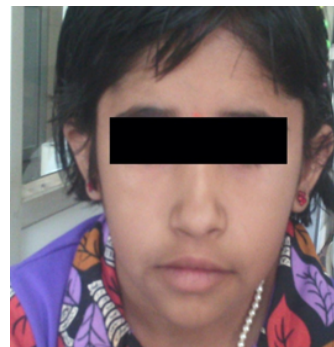
FIGURE 1 Showing webbed neck

Radiological examination of cervical spine revealed blocked vertebrae along with spinal bifida figure (3). Echocardiography test was done in our hospital, report revealed that small Ventricular Septal Defects (VSD) with 3.7 cm. (Figure 4). On her physical examination broad chest revealed high scapula on left side as compared with normal right shoulder joints (Fig 4). Karyotyping analysis performed for baby & her parents, no significant changes were observed in chromosomes (46 XX, XY).