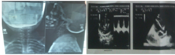
FIGURE 3 Radiological examination of cervical spine revealed blocked vertebrae along With spinal bifida Figure 4 Echo with Small ventricular septal defect