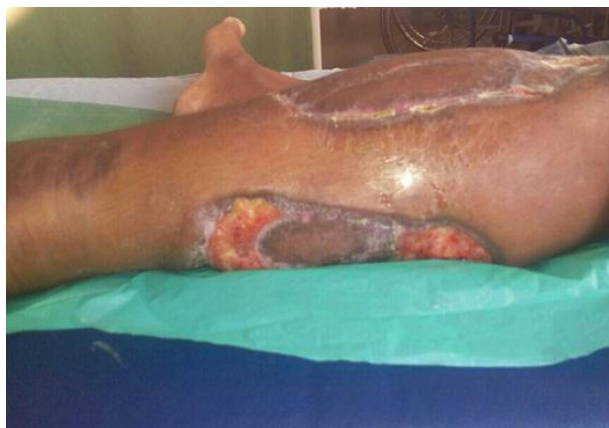
Fig. 01. Necrotizing fasciitis affected lower extremity.

Length of hospital stay as a consideration, it was observed that 21 patients stayed for about 10-15 days followed by 20 patients for 7-10 days, and 7 patients were observed with maximum length of hospital stay for more than 30 days (Table 12). A group of people where a late- debriment test was performed, significantly ( P < 0.001 ) increases the length of hospital stay in comparison with group where early debriment test was done (Fig. 02).