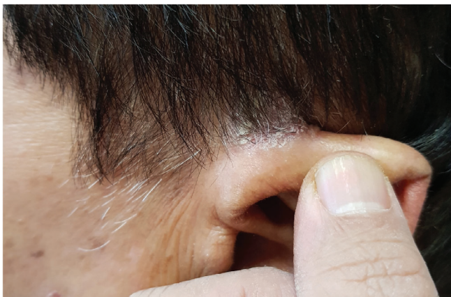
FIGURE 1 Well-defined plaque with silvery white scales

It has been shown that the disruption of a functional and structural permeability barrier is critical for the appearance of psoriasis as Köebner reaction. 4 Accordingly, the importance of the rupturing of the epidermis in initiating the Köebner response has been well documented. Along