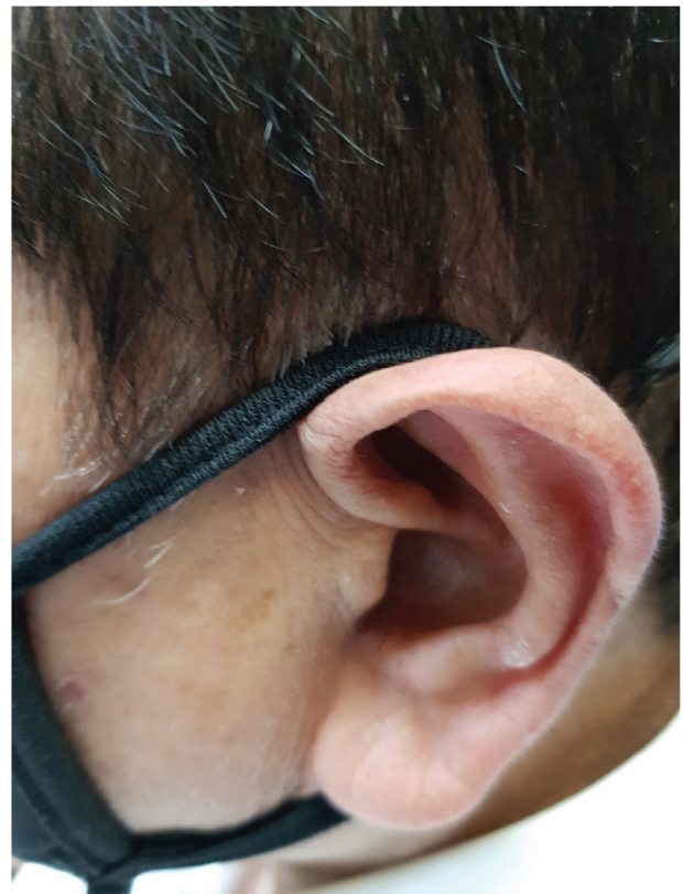
FIGURE 2 Face mask with ear loops