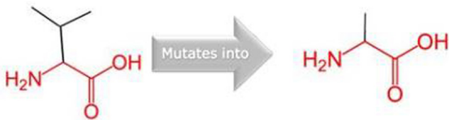
Fig. 4. Amino acid structure of valine to alanine.

minor allele of c.551T > C was a risk factor compared with the wild-type allele. Three genetic models (codominant, dominant, and recessive) were applied to analyze the significance of the association between the novel mutation and autism risk using logistic regression. A statistically significant increase in the risk of autism was observed for the C/C genotype compared to the wild-type T/T genotype (OR, 96.68; 95% CI, 5.8 to 1,607.1; p = 0.001), which corresponds to a 96.68-fold increased risk of autism under the codominant model. The combined genotype (T/C + C/C) also significantly increased the autism risk under the dominant model (OR, 24.7; 95% CI, 5.7 to 106.4; p = 0.001) (Table 5). We implemented a stratification analysis by sex to evaluate the sex association between the novel mutation allele and autism. We found that the C/C genotype was associated with an increased risk for autism in