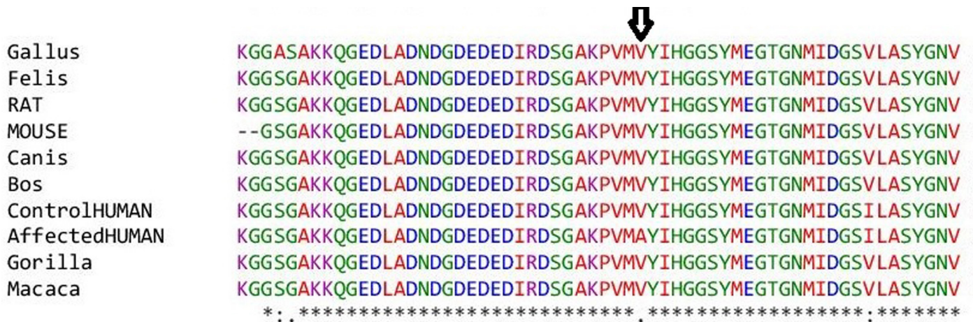
Fig. 2. Multiple sequence alignment of neuroigin 3 protein sequences. The amino acid residue at 184 is arrowed.

protein and the mutated NLGN3 (p.184A) protein were generated using the homology-modelling server Swiss Model. The wild-type protein had a Q_{mean} of -1.24 and the mutated NLGN3 protein had a Q_{mean} of -1.32 . At residue V184, two H-bonds were observed with V264 in