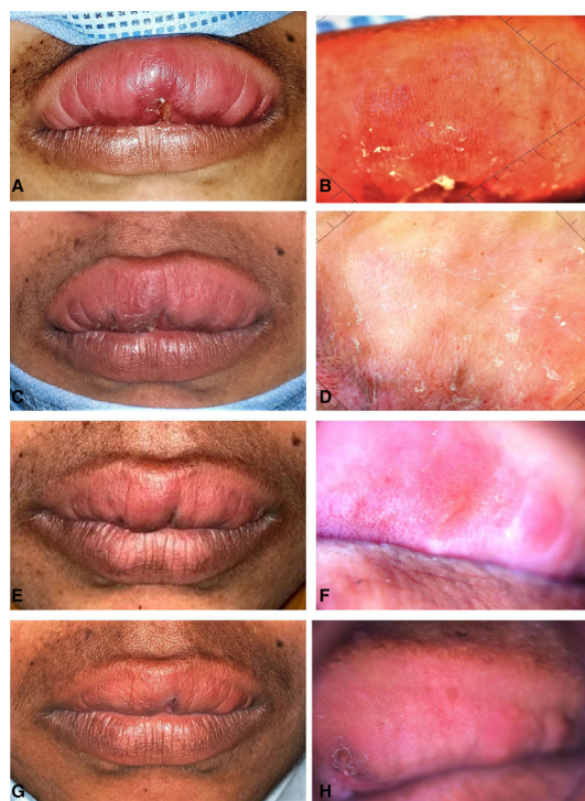
Figure 1 Pretreatment (A,B) and serial post-treatment (C–H) clinical and dermoscopic features of granulomatous cheilitis. Note the diffuse yellow-orange background on dermoscopy before treatment (B) and its progressive resolution (D,F,H) corresponding to the progressive reduction in the swelling (C,E,G). (Dermoscopy: polarised, \times 20 ).

Granulomatous cheilitis is a component of orofacial granulomatosis—a chronic inflammatory disorder of imprecise aetiology characterised by non-caseating granulomatous inflammation of oral and maxillofacial soft tissues. It includes two conditions—Merkelsson-Rosenthal syndrome (chronic lip or facial swelling, facial palsy and fissured tongue) and granulomatous cheilitis of Miescher (swelling confined to the lips). The latter affects young adults involving one or both the lips. Various treatment modalities include systemic or intralesional steroids, clofazimine, minocycline, metronidazole, dapsone, thalidomide and surgery in recalcitrant cases or cases with severe deformation. 1