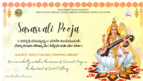
Sarasvati Pooja 03.10.2022.png

2) Plz. download the reports sent to your mail and save them in the pen drive/HDD of your computer/laptop. Once it is deleted from my mail, you will not get it back once again, if it is a Google Drive link.