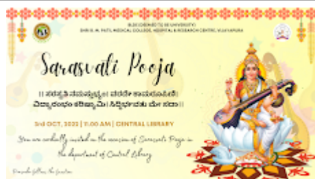
Sarasvati Pooja 03.10.2022.png

2) Plz. download the reports sent to your mail and save them in the pen drive/HDD of your computer/laptop. Once it is deleted from my mail, you will not get it back once again, if it is a Google Drive link.