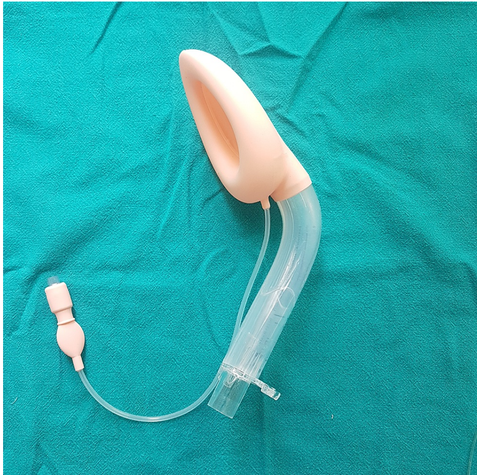
FIGURE 1: BB-ILMA

intubated using an F-ILMA (Figure 2). To promote Fastrach passage, the patient's mouth was opened, and the tongue was displaced with a disposable sterilized wooden tongue depressor. Pre-lubricated F-ILMA was inserted with mild inward and downward pressure, utilizing the device's curvature as a guide, until a set resistance to further progress was sensed, and the cuff was inflated and checked for respiration after connecting the F-ILMA to the breathing circuit. The presence of chest movements and EtCO 2 waveforms provided evidence of adequate ventilation.