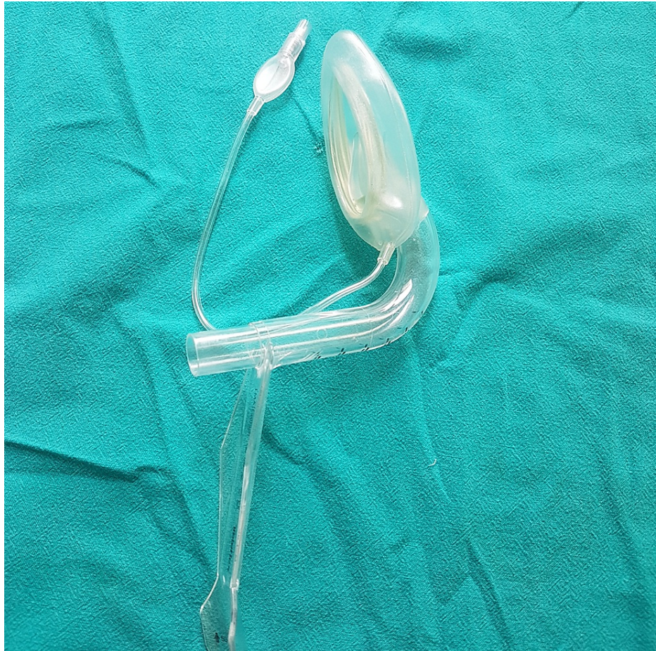
FIGURE 2: F-ILMA

F-ILMA - Fastrach intubating laryngeal mask airway