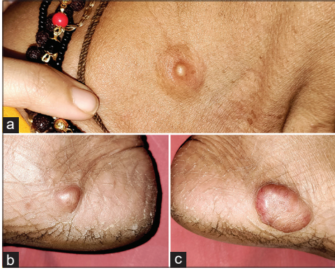
Figure 1: Well-defined firm skin-colored nodules over the right side of the neck (a) and medial aspects of the right (b), and left (c) feet near the heels

A woman in her 50s presented with asymptomatic slow growing swellings over the neck and bilateral feet since