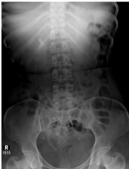
Figure 1 X-ray KUB with radio-opaque shadows in the right distal ureter region.

A female patient in her 30s presented with pain in the right side of the abdomen for 1 month. She also reported burning micturition and fever 10 days ago. The complete blood count and urine routine examination were normal, and the serum creatinine was 0.9 mg/dL. X-ray KUB (X-Ray of Kidney ureter and bladder) (see figure 1 ) and USG KUB (Ultrasound of Kidney ureter and bladder) showed radio-opaque shadows in the right distal ureter region and the right renal shadow region. CT urogram (see figure 2 ) was suggestive of a large linear hyperdense calculus of about