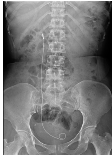
Figure 5 Post-percutaneous nephrolithotomy X-ray KUB with double J stent in situ.

stones. 7 Spontaneous passage of steinstrasse formed after renal interventions occur in 50%–60% of cases, but these are mainly small fragments belonging to type 1 or 2. Only in rare cases are type 3 fragments formed after treatment of renal stones, and their expulsion requires intervention. This report mentions large fragments belonging to grade 3. The literature does not mention the spontaneously formed steinstrasse's expulsion rate, and the formation or expulsion behaviour is difficult to predict.