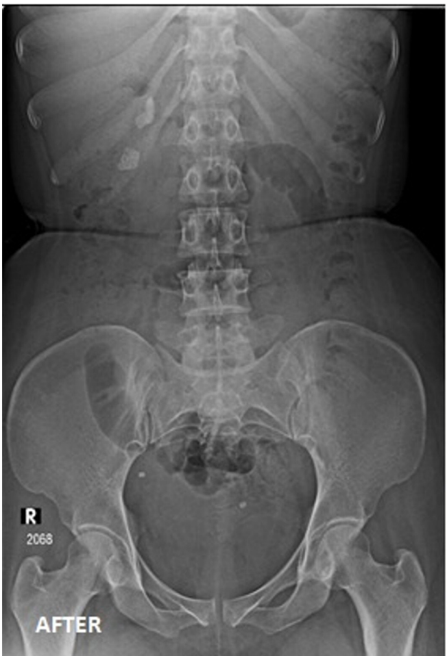
Figure 4 X-ray KUB after the spontaneous passage.

Deirdre et al concluded in their study that the spontaneous passage rate for stones 1 mm in diameter was 87%; for stones 2–4 mm, 76%; for stones 5–7 mm, 60%; for stones 7–9 mm, 48% and for stones larger than 9 mm, 25%. Spontaneous passage rate as a function of stone location was 48% for stones in the proximal ureter, 60% for mid-ureter, 75% for distal ureter stones and 79% for ureterovesical junction