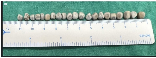
Figure 3 Spontaneously expelled calculus.

Types of steinstrasse: (Radiological grading) Coptcoat et al 5